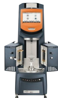
TA Instruments - Rheometer