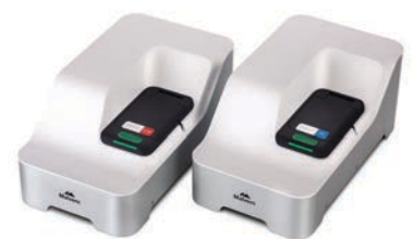
Malvern Panalytical - Zetasizer